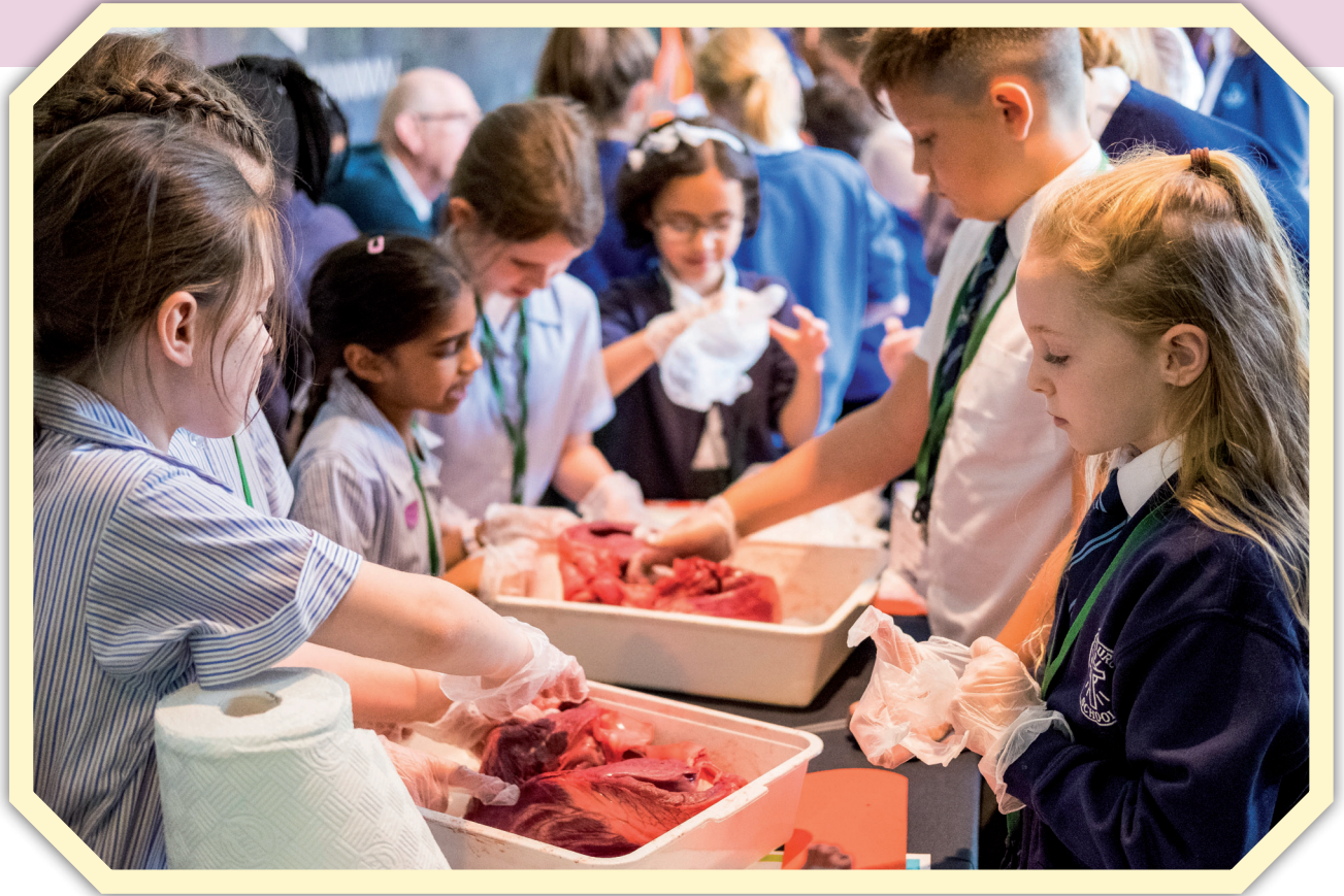
Figure 2 Being non-competitive and inclusive, GSSfS embraces all pupils

the campaign with mass engagement as a target, but not at the expense of quality science-learning experiences. I saw it as means by which teachers could come together to celebrate our subject, while also feeding and developing it by sharing practice, offering guidance and support, and opening up collaborations to enhance learning opportunities for primary and lower-secondary school children.