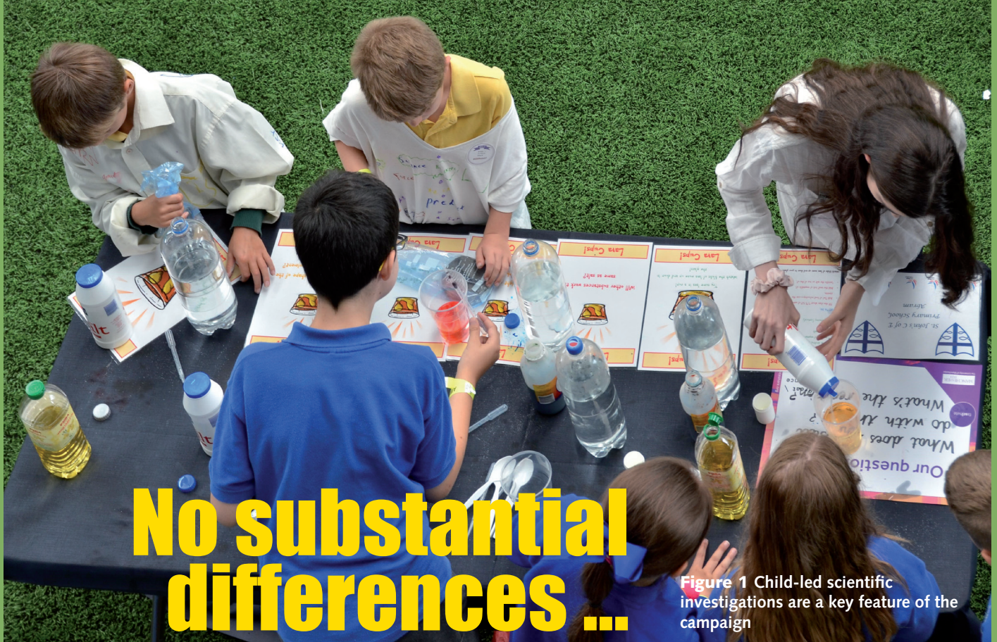
Figure 1 Child-led scientific investigations are a key feature of the campaign